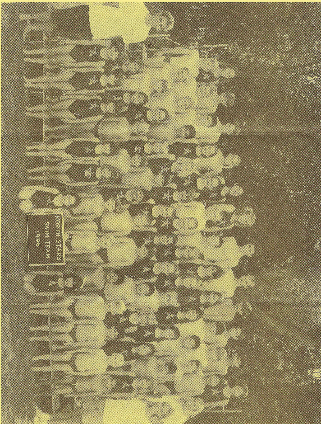
NORTH STARS SWIM TEAM 1996