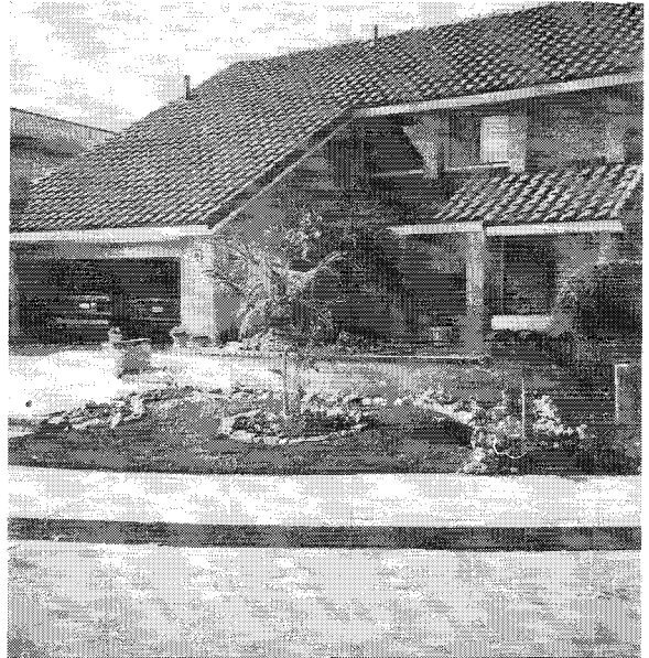
Landscape Award Winner-Murray & Amy Falk of 19 Ensueno East