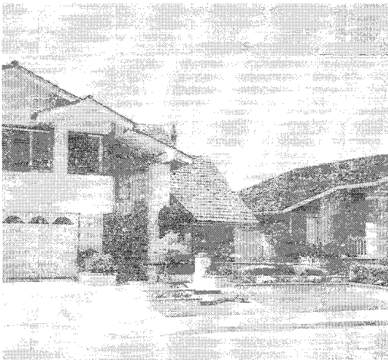
The Vishney residence at 18 Palmatum