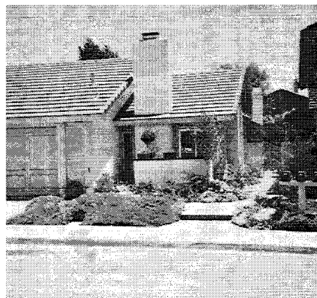
The Rounsavel residence at 24 Lucero East