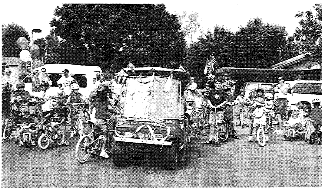
Park Paseo youngsters show their patriotism at the 4th of July bike parade