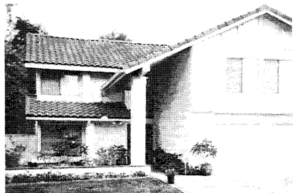
The Lew residence at 9 Glorieta East