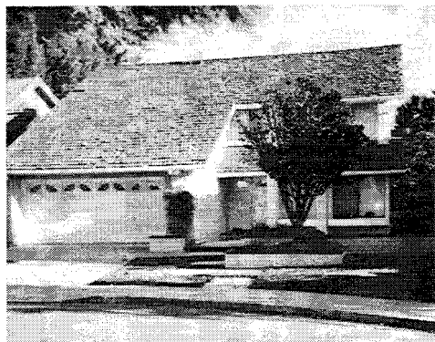
The Mantle residence at 22 Ensueno West