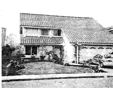
The Paulsen residence at 7 Ninos