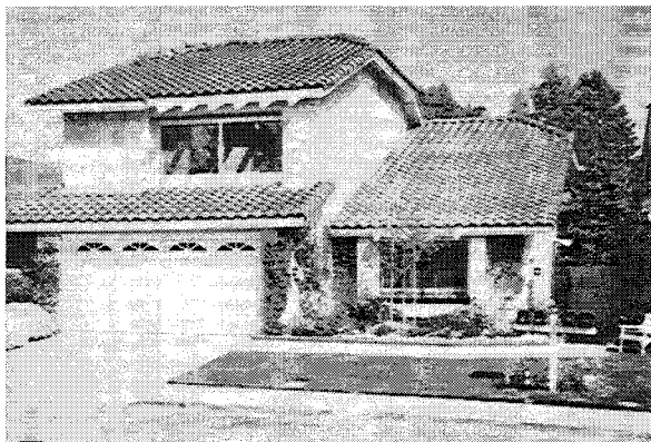
The Willhoit Residence of 16 Lucero West