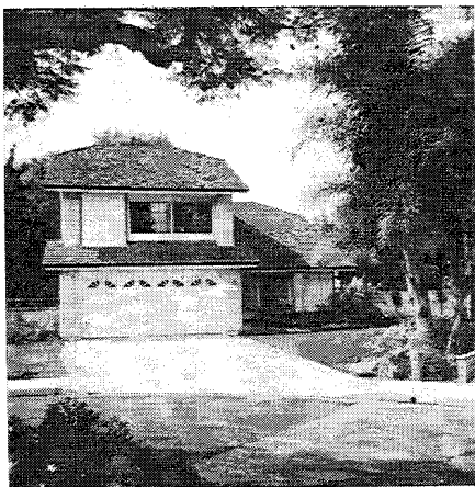
The Weis residence of 61 Diamante