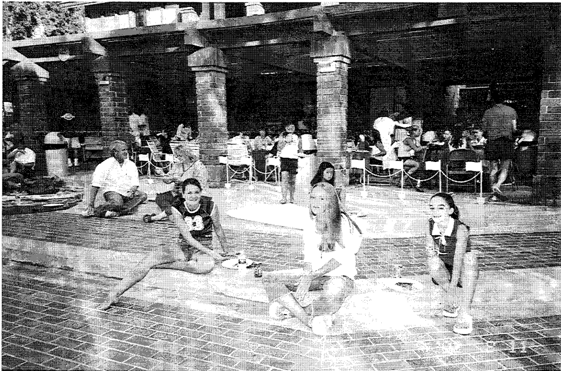
Swimmers, coaches and parents enjoy the year-end festivities.