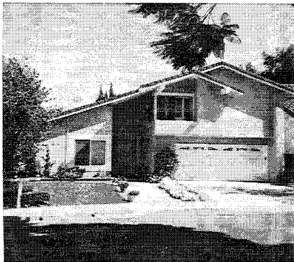
The Kopec residence of 25 Glorieta West