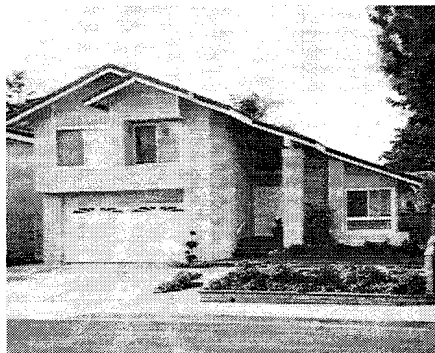
The Pennella residence of 7 Ensueno East