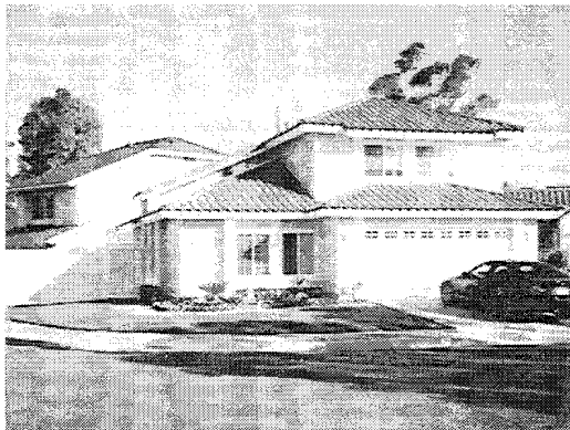
The Lim residence of 7 Diamante