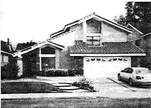
The Tag residence of 14 Christamon West