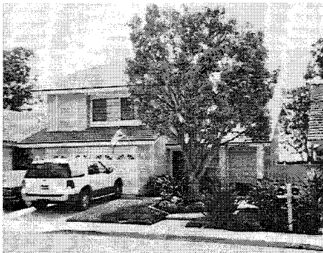
The Hunsucker residence of 35 Diamante