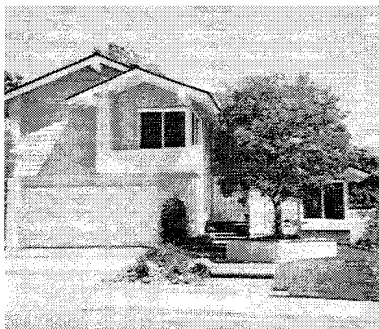
The Caton residence of 16 Christamon West