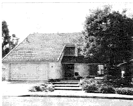
The Black residence of 6 Christamon West