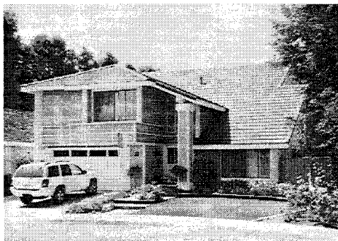
The Monjay residence at 24 Glorieta West