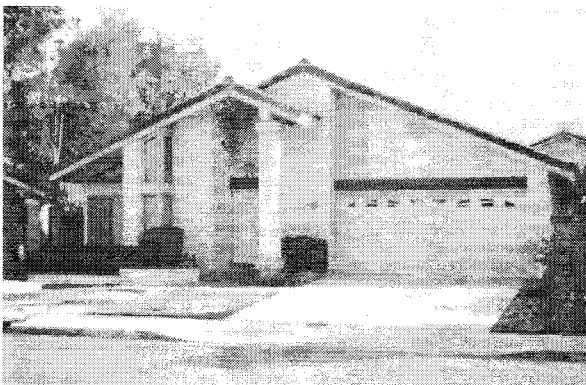
The McVeigh residence at 17 Kara East