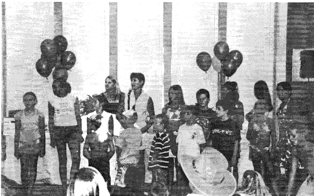
The Northstars Swim Team 2003 Annual Awards Banquet