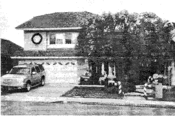
The McCloskey Residence at 49 Diamante