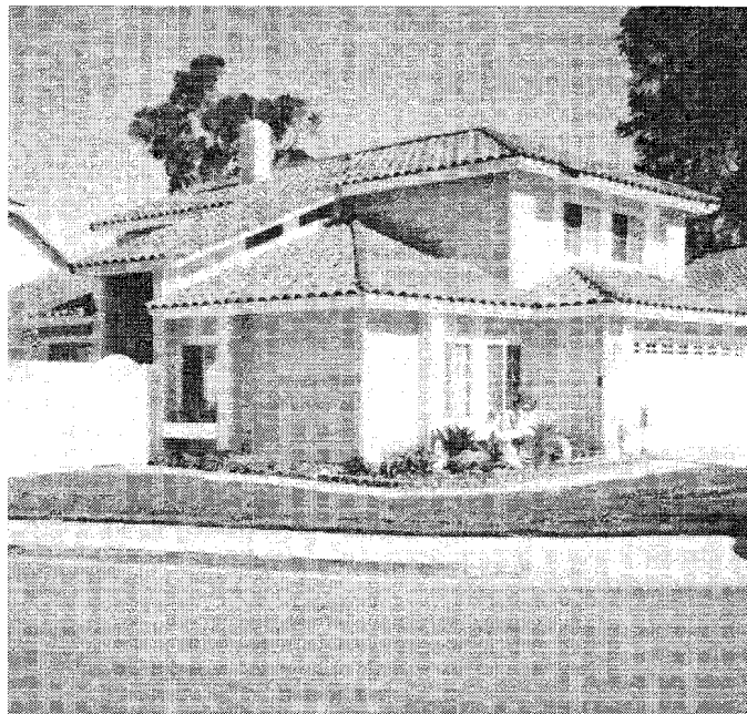
The Park Paseo 2003 Annual Landscape Award Winner, the Lim Residence of 7 Diamante