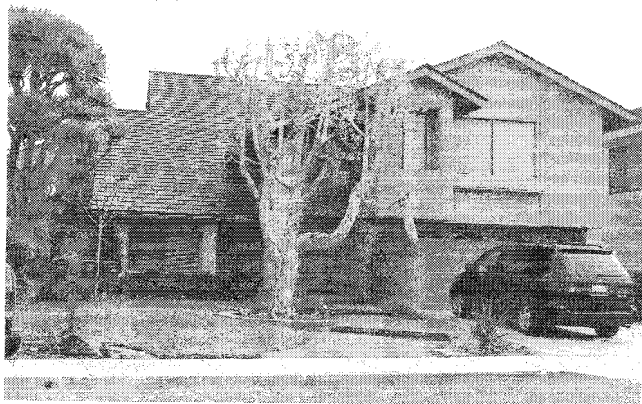
The Bland Residence, 13 Kara East