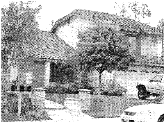
The Andre Residence of 19 Lucero West