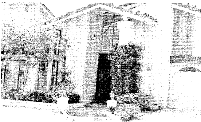
The Otero's 25 Christamon East