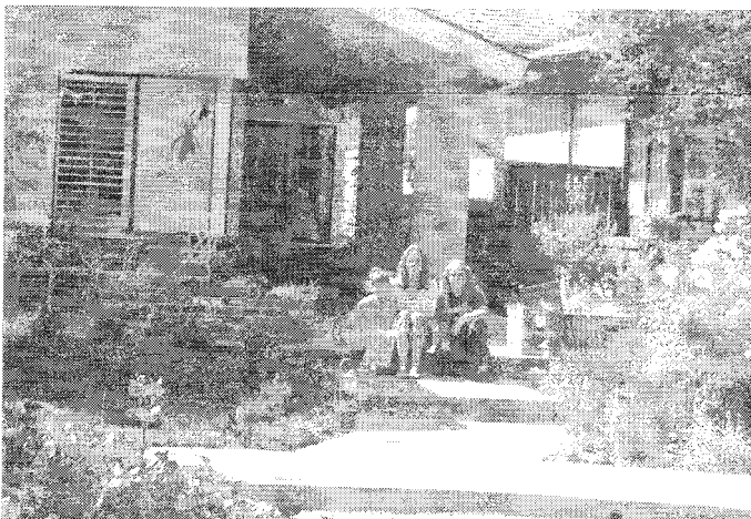
The Ciavarella's 36 Fortuna East