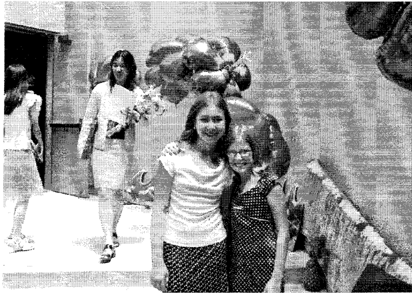
Too Cute Graduates of 6th grade