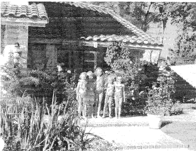
The Simmons residence of 2 Entrada West