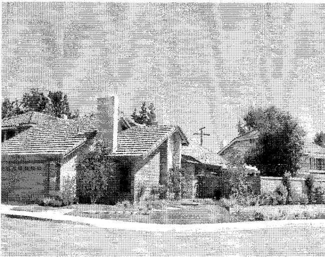
The Cassity Family of 19 Diamante