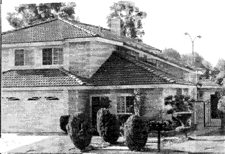
The Kim residence at 14 Entrada West