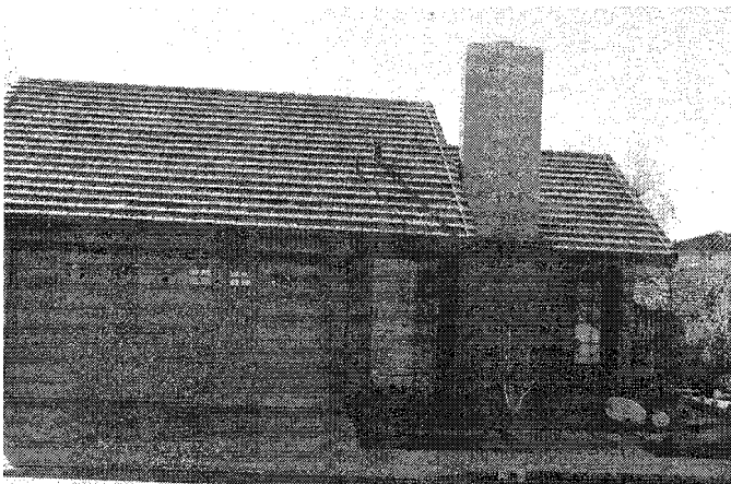
The Cassity Residence at 19 Diamante