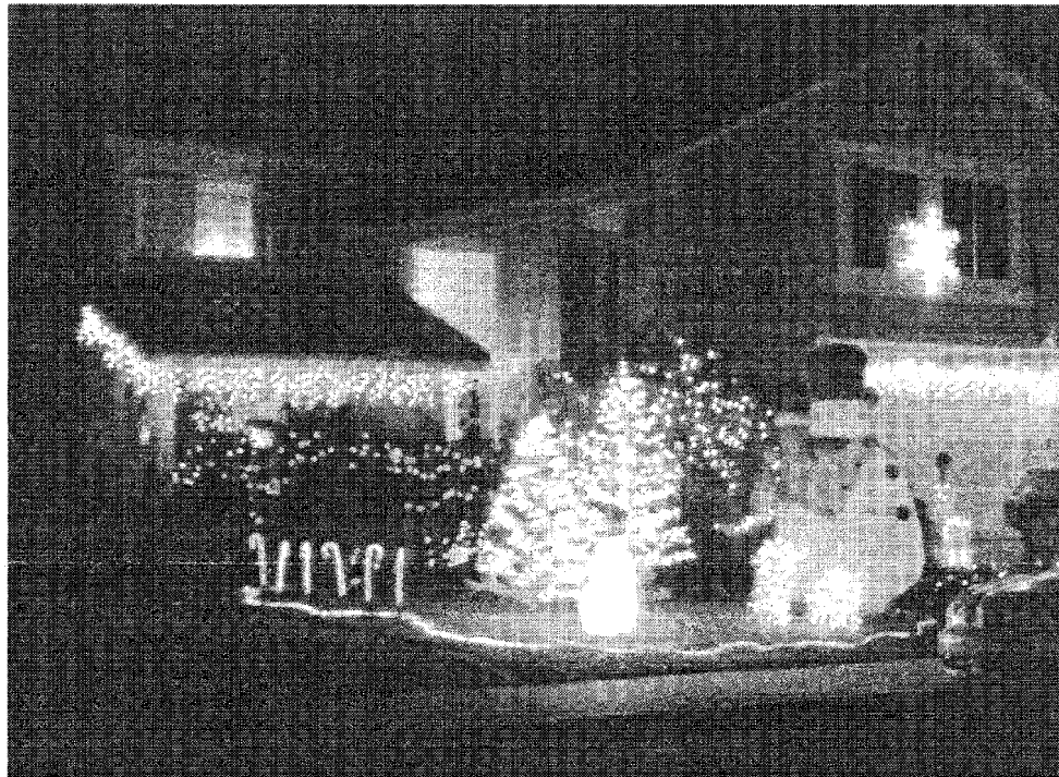
The Pepper Residence of 26 Christamon East