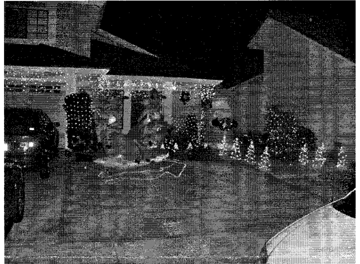
The Residence of 22 Entrada East