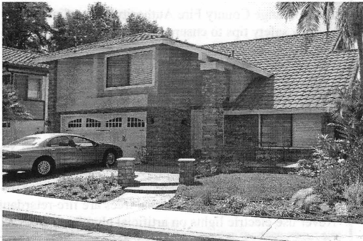
Annual Landscape winner receives a $50.00 Gift Certificate!