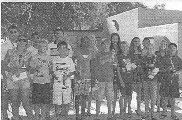
Prize winning Park Paseo Northstars team members

Park Paseo Homeowners' Association 25 Christamon West, Irvine, CA 92620