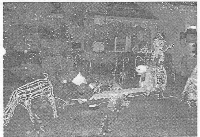
Lin residence at 23 Lucero East-third year winner!