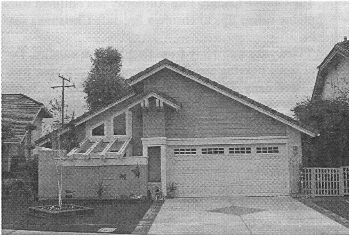
The annual landscape winner receives a $50.00 gift certificate.