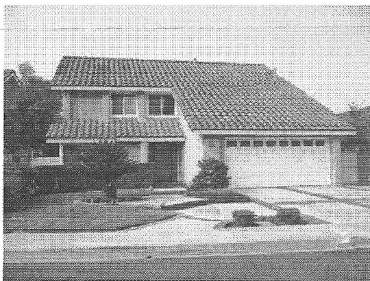
The Book Family 14 Fortuna West